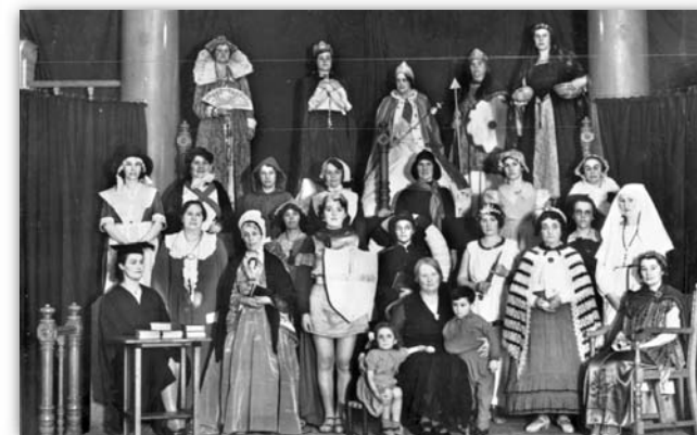
Fancy Dress Pageant at the Congregational Chapel